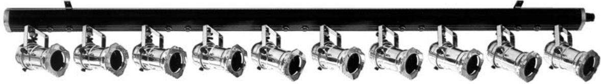
PAR 16 Bar