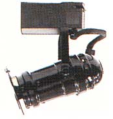
PAR 16 Track Mount