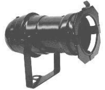
PAR 16 Black