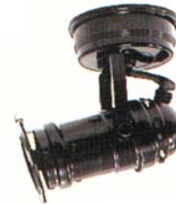
PAR 16 Ceiling Mount