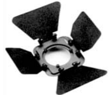
PAR 16 Barndoors