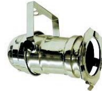
PAR 16 Polished