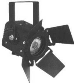
#Micro-PAR with Barndoors