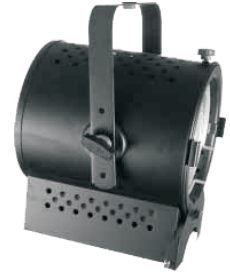
#75 and #175 6" Fresnels