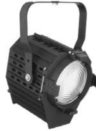
#1KAF 6" Fresnel