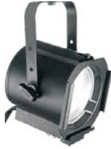
#65 6" Fresnel