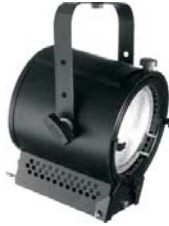
#165 6" Fresnel