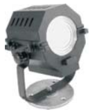
#100 3" Fresnel